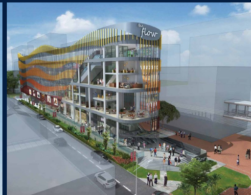
5th & 6th Storey